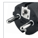
Safety plug (10 A)