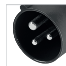
CEE blue (16 A)